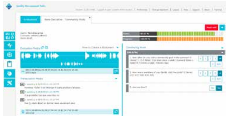
QUALITY MANAGEMENT SUITE EVALUATION SCREEN

Investing in your employees through training and quality monitoring programs can positively impact your business. Quality Management Suite enables you to document interactions as well as provide consistent and constructive feedback to employees. This solution is not restricted to contact centers but can be used across many business areas that need to understand the quality of service delivered, from help desks and desk-based sales teams to individual operators and call attendants.